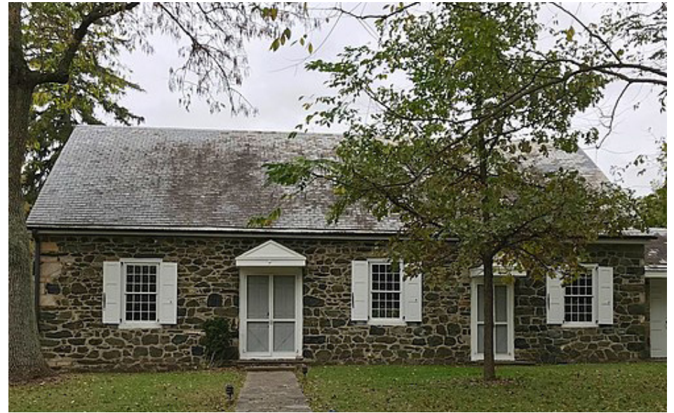
Birmingham Friends Meetinghouse, 1763