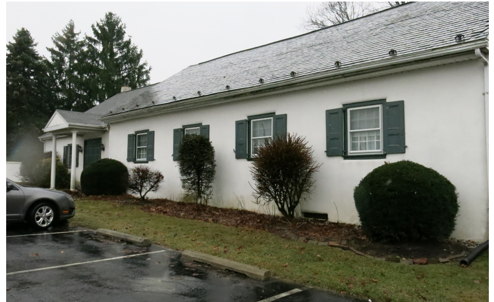
Fallowfields Meetinghouse, 1811