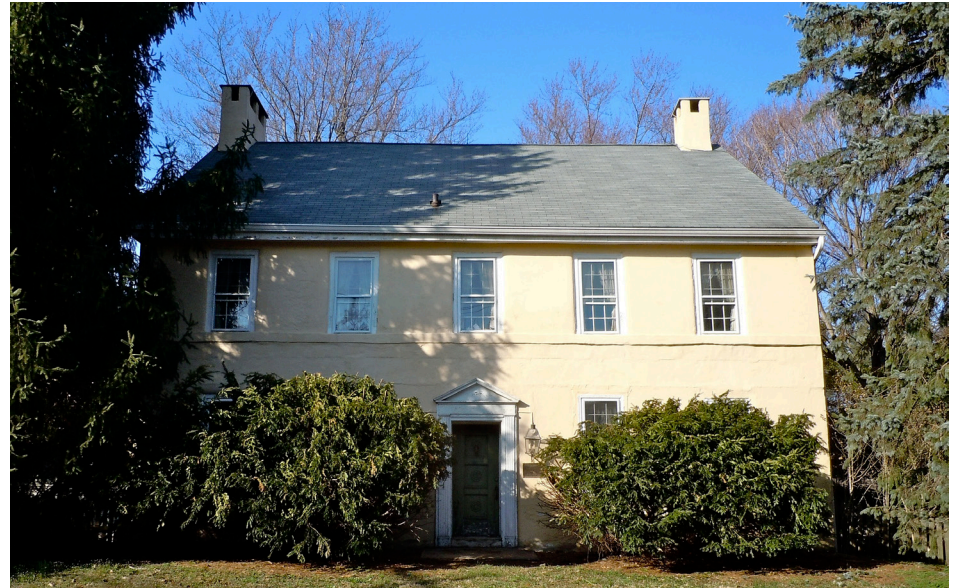
White Horse Tavern, 1816