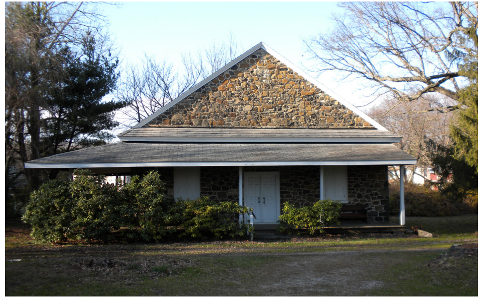
Bradford Friends Meetinghouse, 1764