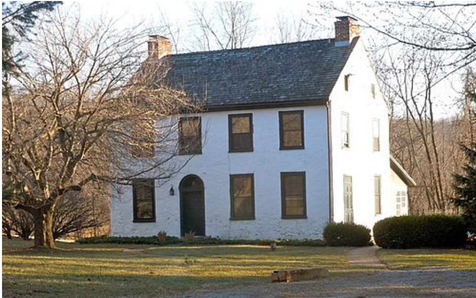
Mansel Passmore House, 1830